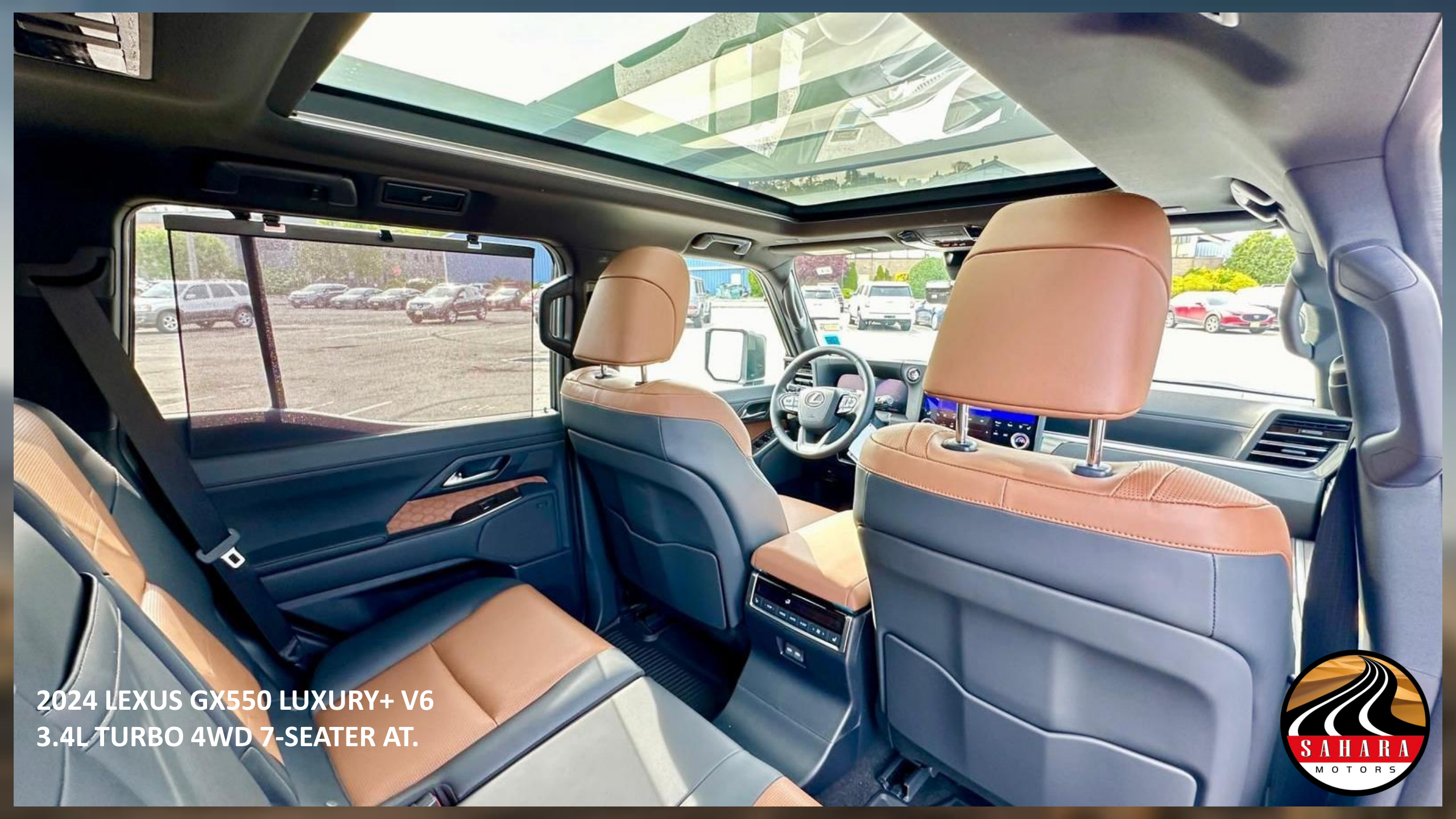
2024 LEXUS GX550 LUXURY+ V6 3.4L TURBO 4WD 7-SEATER AT.