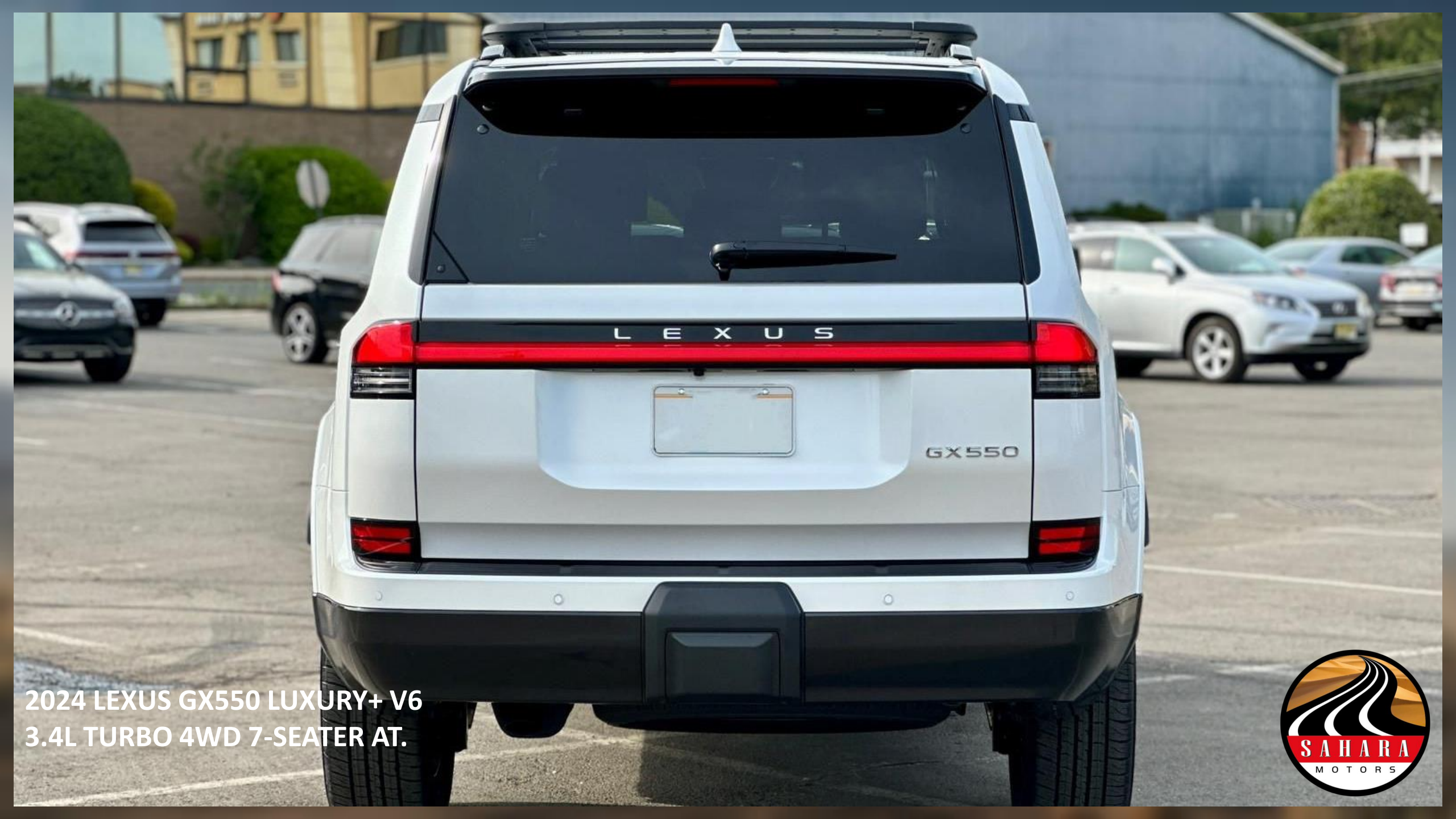
2024 LEXUS GX550 LUXURY+ V6 3.4L TURBO 4WD 7-SEATER AT.