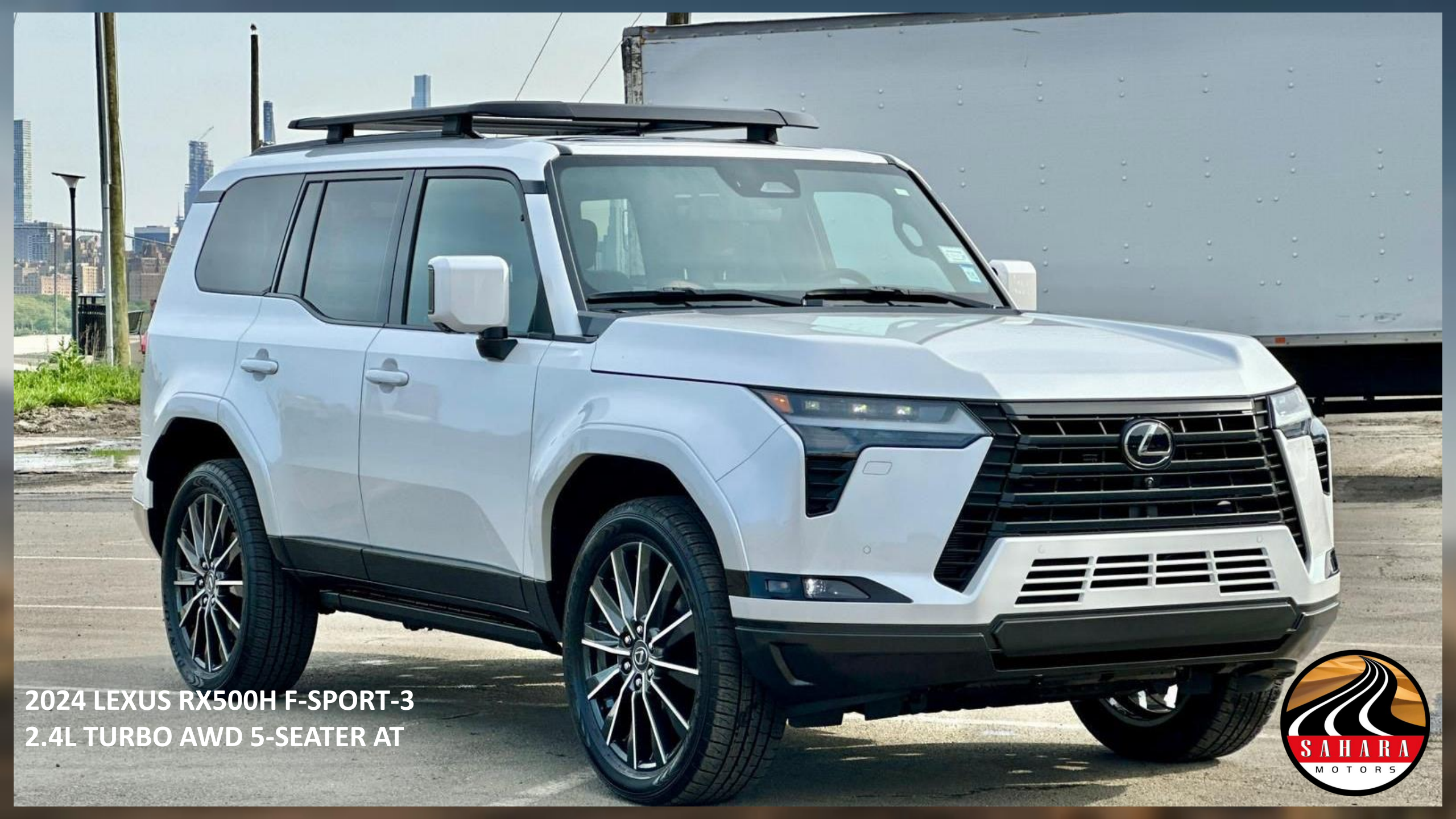
2024 LEXUS RX500H F-SPORT-3 2.4L TURBO AWD 5-SEATER AT