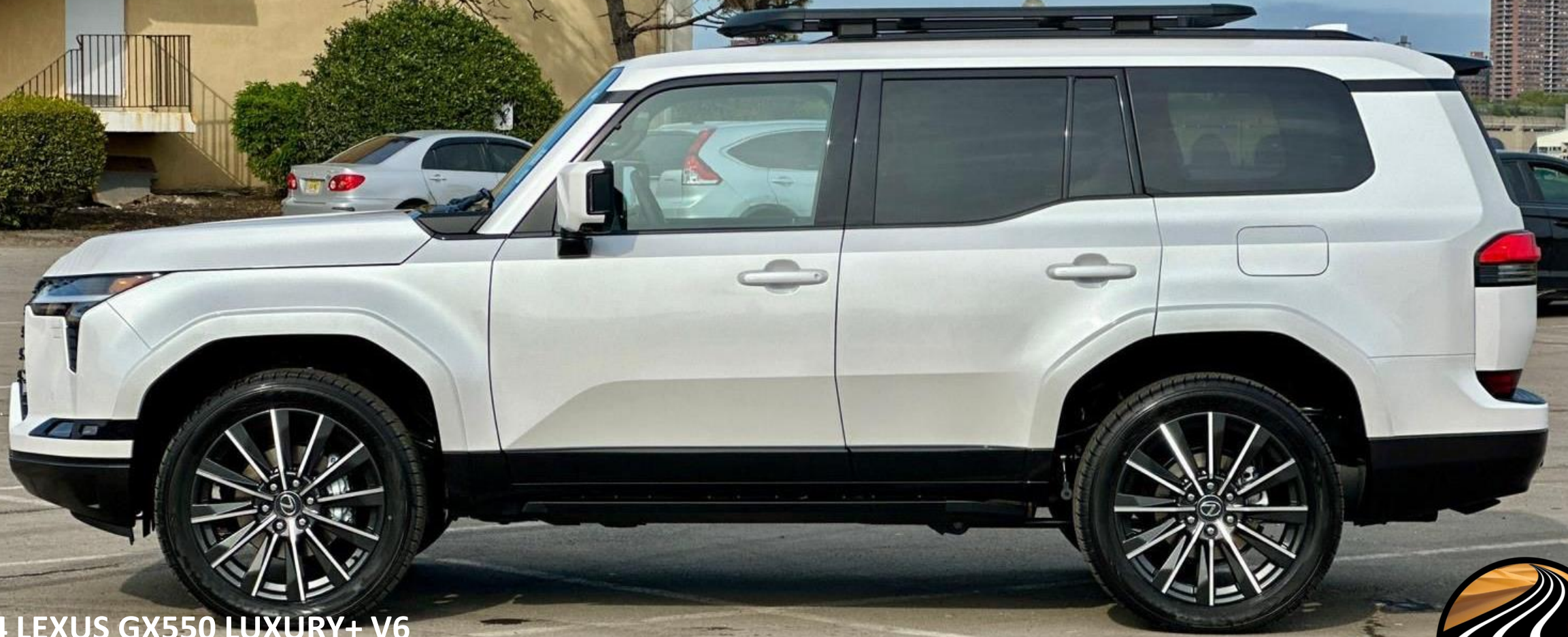
2024 LEXUS GX550 LUXURY+ V6 3.4L TURBO 4WD 7-SEATER AT.